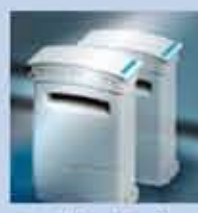
HP Bulk Ink Delivery