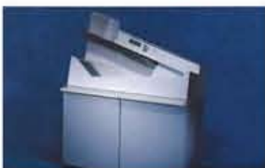
Closed view of Model 206.

* Tyvek is a registered trademark of Dupont Corporation