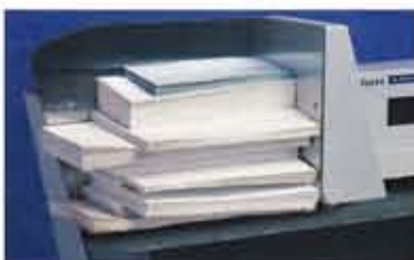
Feed area accepts various size envelopes.