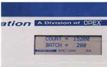
Job running/batching status.